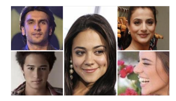
Figure 3. Samples of contentious images, placed in Celeb-O

within the CelebA dataset, annotations were easily verified (by image search) and any contentious cases were placed in CelebO. Example of contentious images are provided in Figure 3.