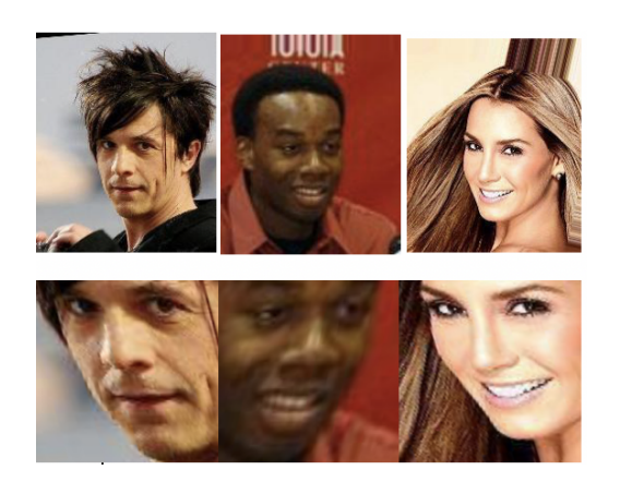
Figure 2. Samples of images augmented by our techniques.

Data Augmentation - To bring the domains closer together, a number of transformations are applied. Using the OpenFace library, we cropped all images to only show the face, aligning the crop with the ears and chin of an image. Images were also scaled to be the same size as the UTK-Face counterparts (200 x 200). Example of transforms are presented by Figure 2.