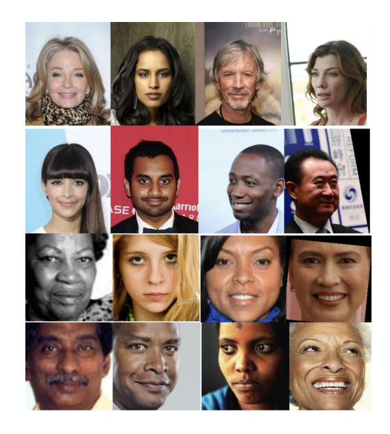
Figure 1. Samples of the Celeb A dataset (1st and 2nd) and UTK-Face dataset (3rd and 4th Row)

However images are not annotated by race. We note the CelebA dataset consists of individuals of different race, yet similar skin-tone (potentially due to industry beauty standards). To establish a ground truth, a set of 2500 images were annotated by two researchers, this set was further split into a training set (2000 images) and a validation set (500 images).